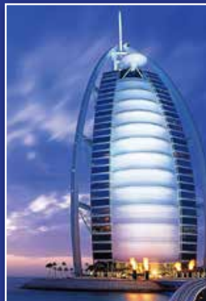
Burj Al Arab, the first 7 star hotel in the world