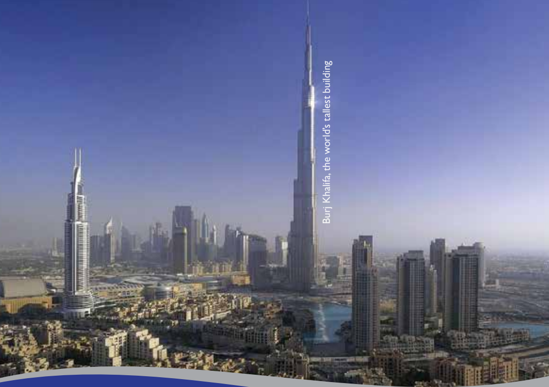
Burj Khalifa, the world's tallest building