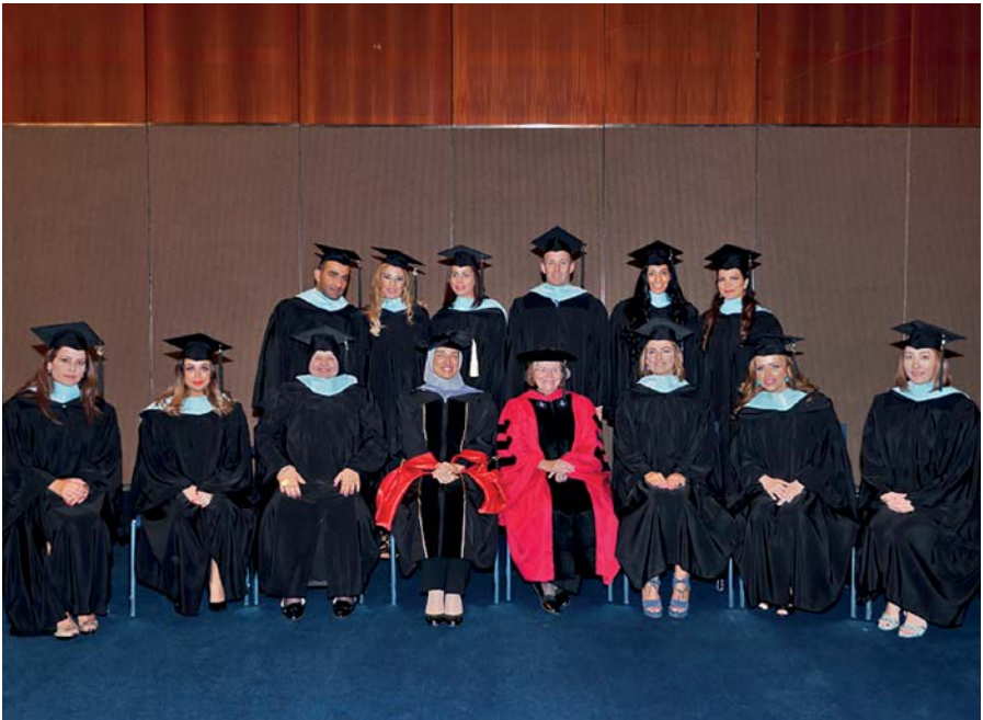
1st Cohort of M.Ed. Graduates Class of 2014